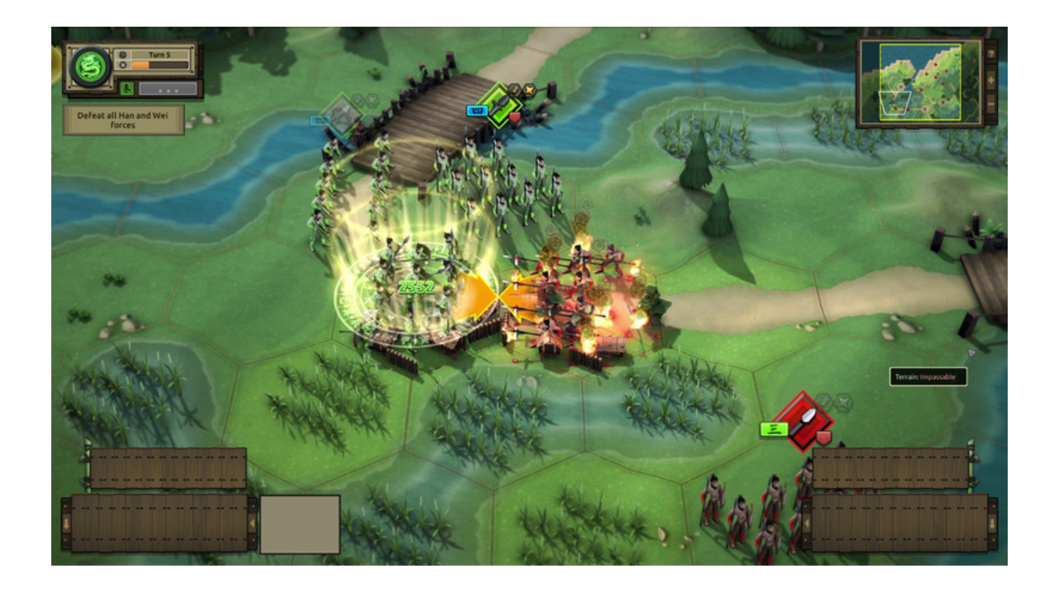
Download ->->-> <a href="http://bit.ly/2SSqMeU">http://bit.ly/2SSqMeU</a>